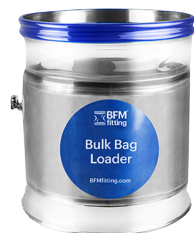
Bulk Bag Loader